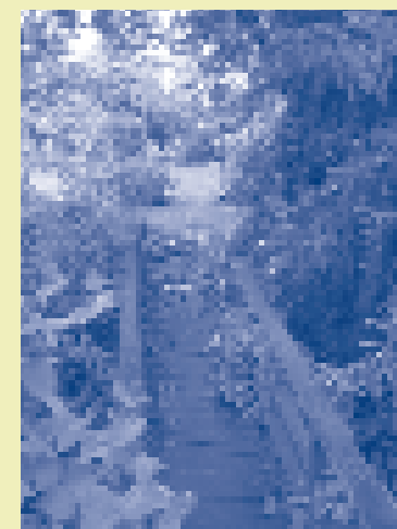
Native and Mediterranean plants offer diverse and dynamic choices.

Water needs vary by season and site. Appropriate watering rates moderate plant growth, which promotes plant health. Water that runs off landscaped areas does not help the plants — and it can hurt aquatic life. As water runs off your property, it captures any pollution in its way - e.g. pesticides, trash, fertilizers. This “polluted water” can find its way to the nearest storm drain. All storm drains lead to local creeks, the Bay or Ocean.