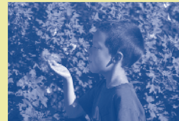
Protect Kids and Pets: if a pesticide is needed at all, use the least toxic available. Learn more at www.OurWaterOurWorld.org